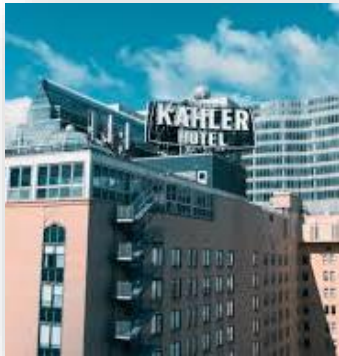
Kahler Grand Hotel - TB Clinical Intensive Conference

Please contact The Kahler Grand Hotel at 1-800-533-1655 or the Marriott Hotel at 507-280-6000 and mention the 2026 TB Clinical Intensive Conference .