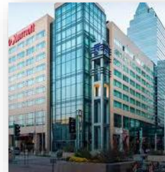
Marriott Hotel- TB Clinical Intensive Conference

Downtown Rochester is currently undergoing construction. Click here up-to-date information on road closures and detours: